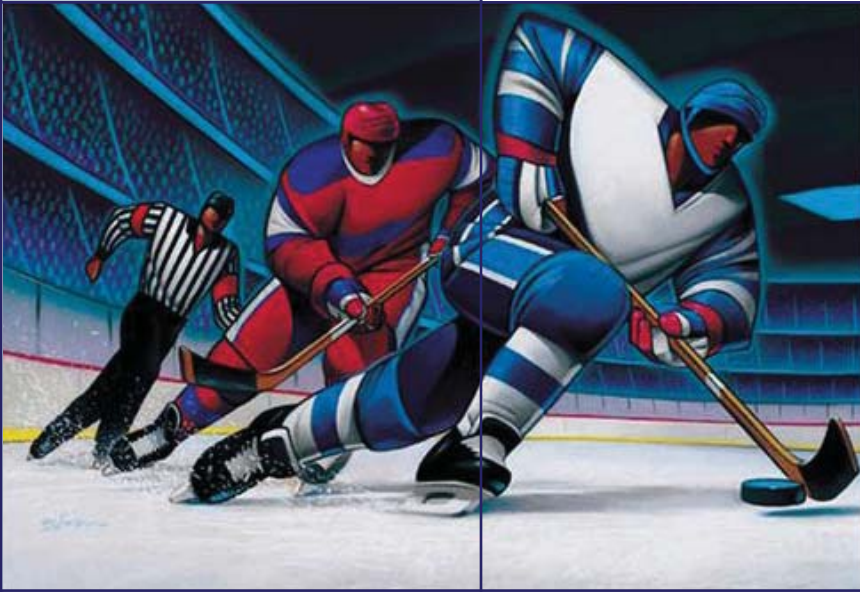
The National Art Museum of Sport