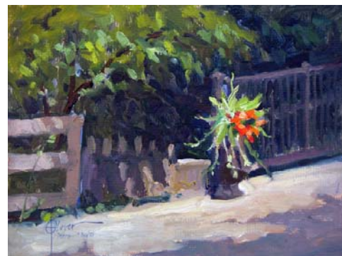
▲ Workshop Demo #2 / Oil on board / 9" x 12" / Sold

Monday mornings, 9:30 a.m. to 12 Noon Monday afternoons, 1:30 p.m. to 4 p.m. Monday evenings, 6 p.m. to 8:30 p.m. Tuesday mornings, 9:30 a.m. to 12 Noon Tuesday afternoons, 1:30 p.m. to 4 p.m. Wednesday evenings, 6 p.m. to 8:30 p.m. Saturday afternoons, 1:30 p.m. to 4 p.m. (not yet confirmed, but possible)