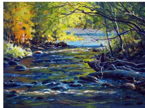
▲ "Whispering Rapids" / Oil on canvas on board / 12" x 16"

We'll be painting at Christian Community Church North, 5586 Olentangy River Road, just south of SR 161 in Columbus. Cost for the 6 weeks: $200. So, here's how it works. We'll need 6 participants to confirm a class. Phone or email us with your interest to register for any class time that might work for you. When we have enough folks to put together for a class in a given time slot, we'll notify all those involved. I realize the time I've given you to register is relatively short, and apologize, but we are facing knee replacement surgery for my wife in the next month, and have had to wait for doctor and hospital schedules to be confirmed. We'll do our best to group folks into classes and keep everyone (hopefully) happy. Please contact me with any questions or issues at (614) 451-9423, (614) 439-0917 (cell), or at mailto:jgloverart@mac.com . Looking forward to meeting you at our first class, and having a great time growing together as artists! Thanks for your interest!