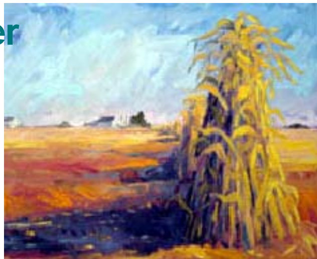
October's masthead art: "Cornrow," Richard Clem

October 20, 2010 November 17, 2010 December 15, 2010 January 19, 2011 February 16, 2011 March 16, 2011 April 20, 2011 May 18, 2011 (Summer break) September 21, 2011 October 19, 2011 November 16, 2011 December 21, 2011