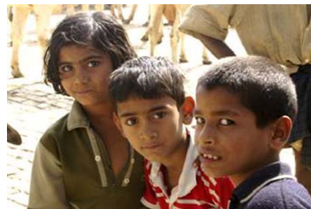
at the Upper Arlington Senior Center, July and August